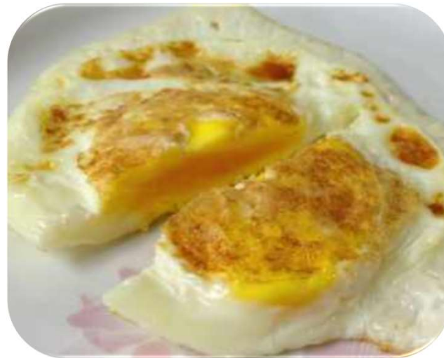
eggs over medium