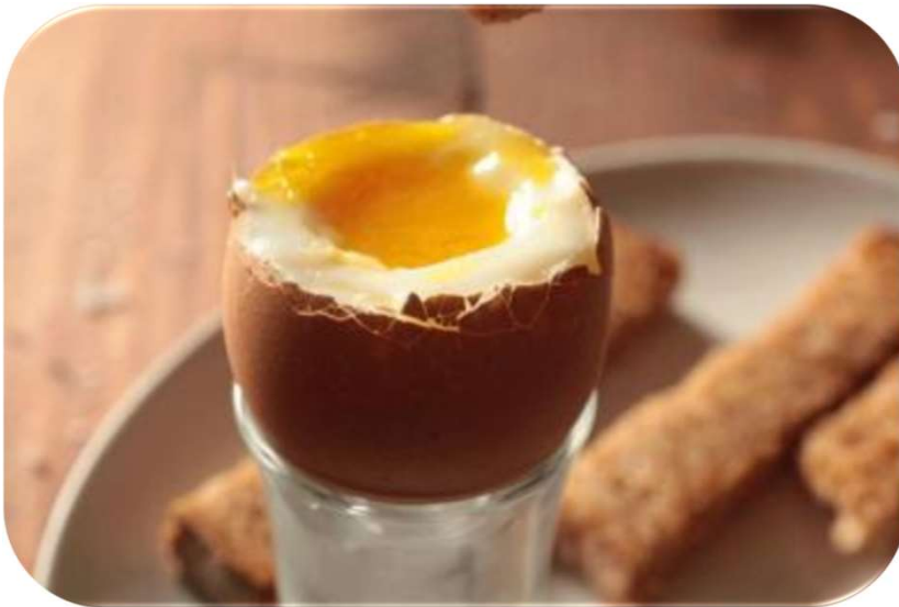
soft boiled eggs