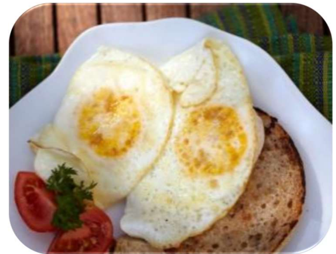
eggs over hard