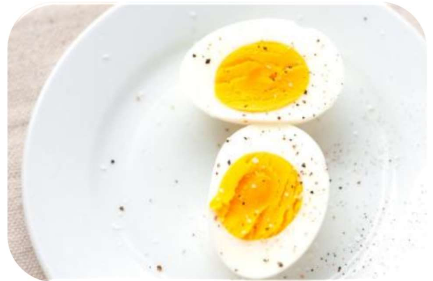
hard boiled eggs